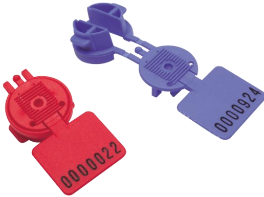
Cap'n lock # 025HPP

A combined capping and sealing device for valve locks, gas meter swivel locks, locking ring systems and similar applications. Does two jobs in one, seals and caps. This one piece, one hand application seal is an optimum solution in hard to reach areas. Numbered with 7 digits stamped in hot foil. Supplied in mats of 8.